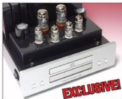
PRIMA LUNA PROLOGUE 8 CD player

BUDGET CD PLAYER GROUP TEST, PRIMA LUNA PROLOGUE 8, GERMAN PHYSIKS HRS120