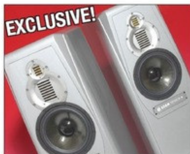
ADAM TENSOR GAMMA loudspeakers