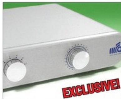
MF AUDIO preamplifier